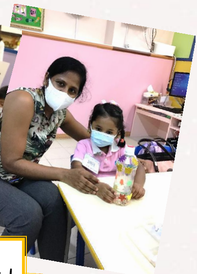
We used recycled materials to make an musical instrument!