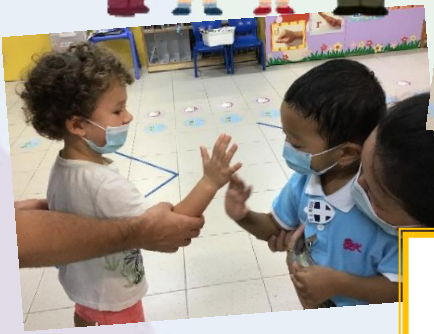
We are trying to deliver the ball!